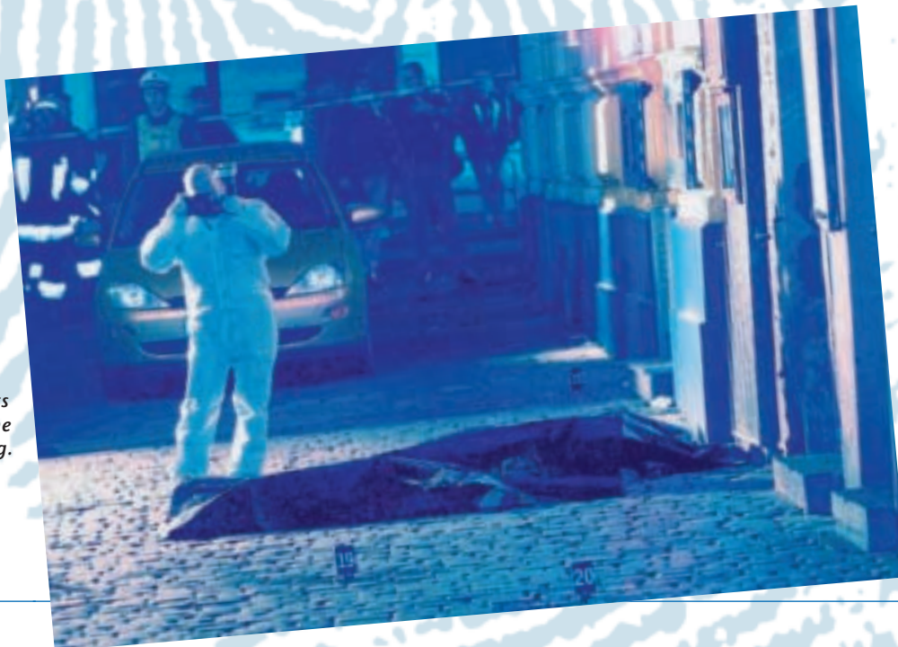
Team of forensic experts at the scene of the crime after a shooting.

The advantages of the cold light kit have convinced forensic specialists in many countries. For example, the German Federal Criminal Police Office in Wiesbaden uses the KL 2500 LCD forensic kit. "We use the unit in our laboratories not only when searching for fingerprints but also when collecting evidence such as hair, fibers, and blood.