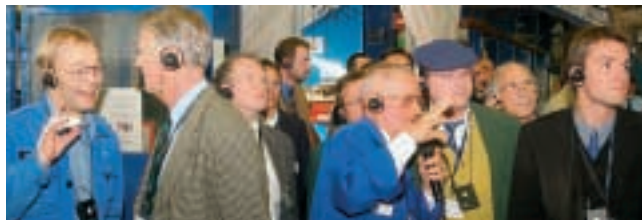
A look at manufacturing practice: SID conference attendees viewing Schott TV glass production.

According to a survey conducted by market research company DisplaySearch (Austin, Texas) the TV sector is currently growing at about 6.6% a year and its volume will have reached 201 million units by 2005. The demise of the cathode ray tube (CRT), which was invented by the German physicist Karl Ferdinand Braun back in 1897, was often predicted, but it is still unlikely to occur within the next few years. Its widespread growth remains much higher than the share accounted for by all the alternative concepts like plasma, liquid crystal or projection TV sets. For Schott, the largest European manufacturer of glass funnels and panels for CRT televisions, this is an important forecast, especially because the company offers lightweight solutions for funnels already and conducts ongoing research into further development.