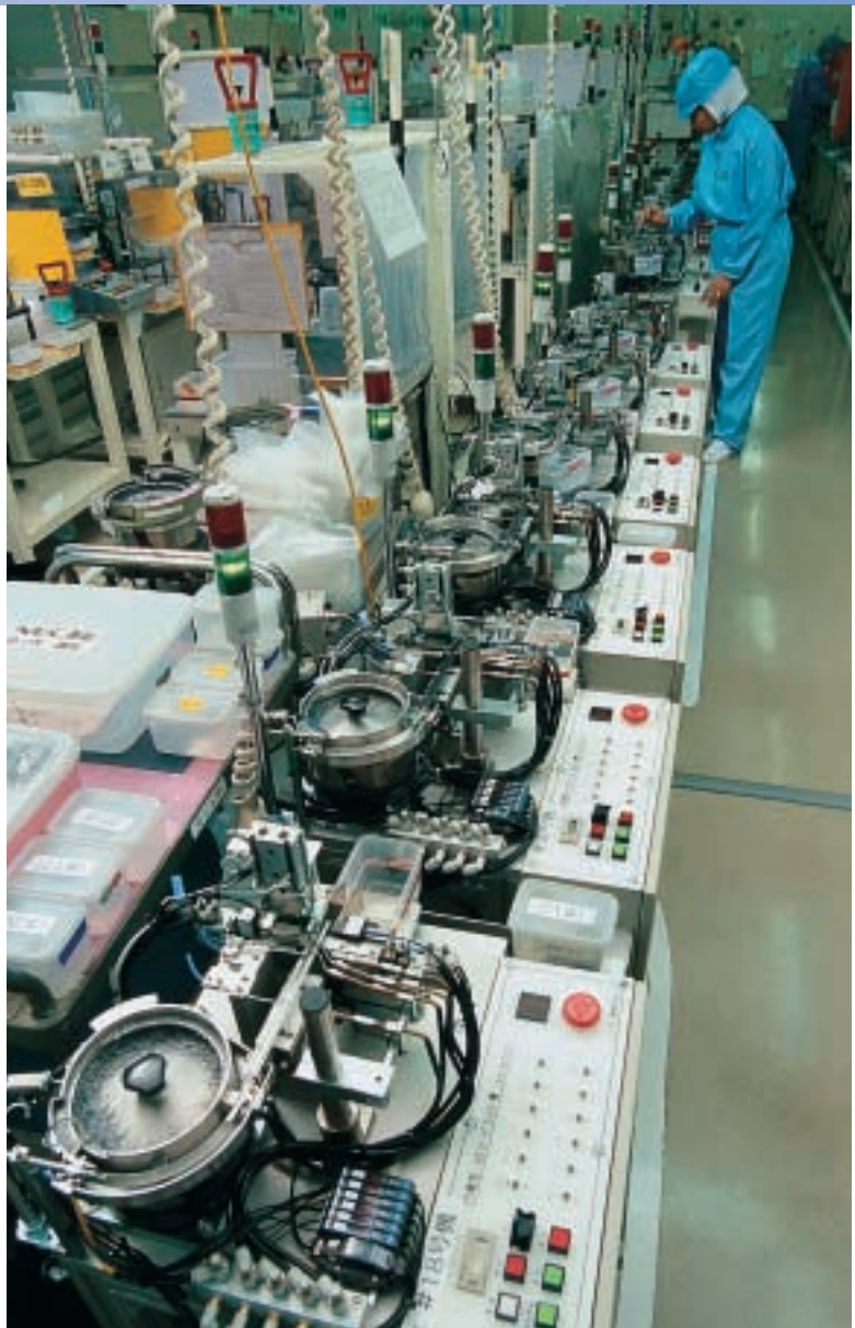
The new NSC joint venture specializes in the mass production of miniaturized quartz oscillator packages and thermal fuses for sensitive electronic appliances.

The aim is to open up new markets and to make the existing but not utilized production line for ceramic packaging commercially successful. On the basis of existing contacts with well-known Japanese firms such as Nippon Denso and Matsushita, new activities in the automotive field are being pursued. Finally there are plans to expand the potential for ceramic packaging and substrates. In the long term NSC is also thinking of looking into completely new packaging technologies, for example chip size packaging and wafer level packaging ■