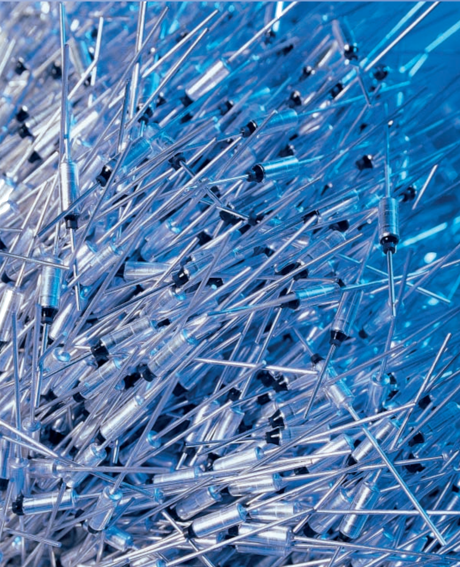
By cutting off the power supply, thermal fuses (here SF type thermal fuse) prevent laptops and electronic appliances from overheating.