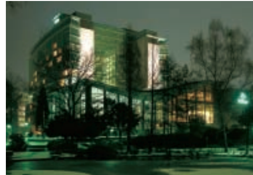
The new Hilton is located in the center of Frankfurt, close to the stock market, the Old Opera House and the banking district.

turn into a chimney. If the lobby were to burn, an escape route for guests on the upper floors must be guaranteed. All corridors up to the seventh floor are open. If a fire were to break out, fire-resistant flame and fume protectors would be lowered from the roof. Starting on the eighth floor, these corridors are fully glazed with clear integrity Pyran S, which stops flames and fumes for at least 30 minutes. The guest rooms on the lower floors facing the atrium are equipped with window glazing which prevents outside flames and fumes from reaching the interior.