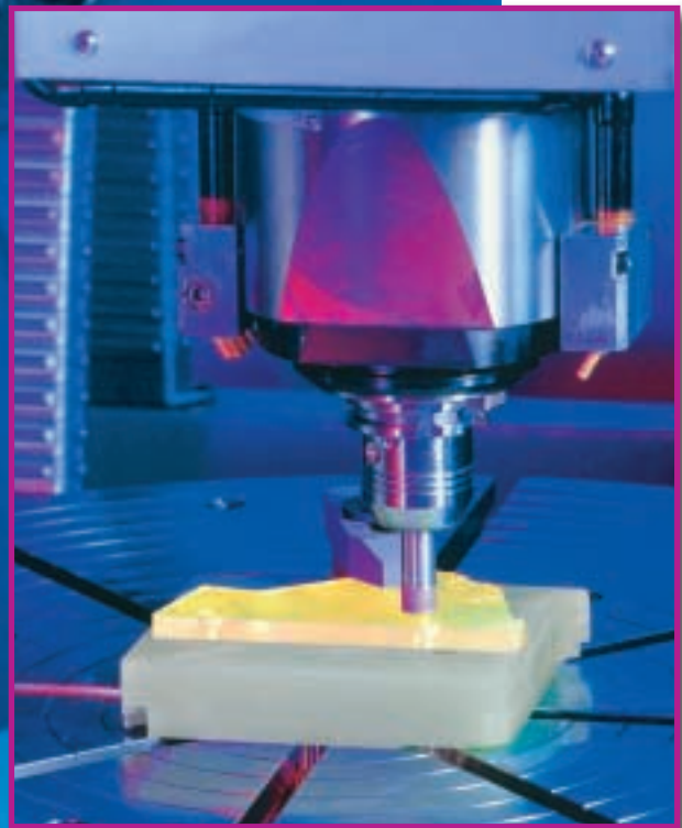
Complex high precision structures can be achieved with ultramodern technology.