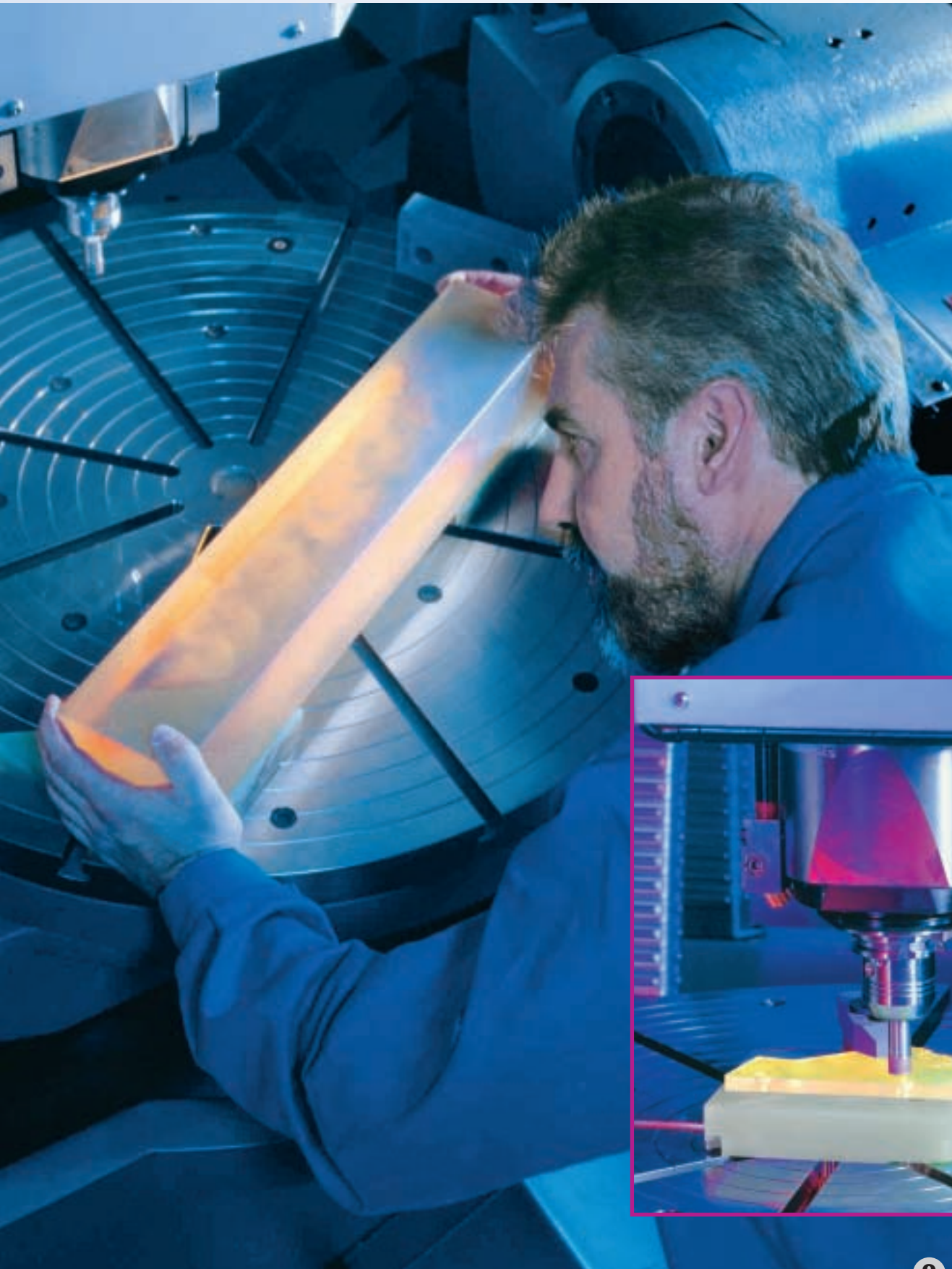
Clamping a "Zerodur" block.