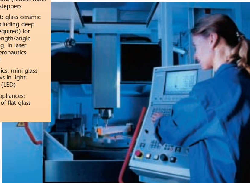
The heart of the new service center is a five axis machining unit.