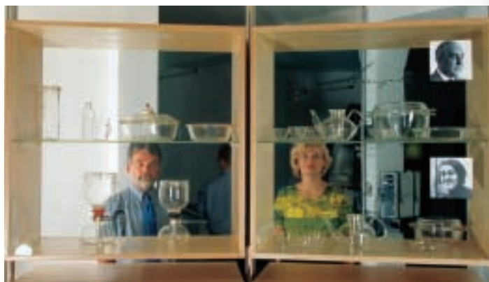
Coming face to face with the past: Classic items of household glassware from Jena, for example heat resistant "Jenaer Glas" cookware and tableware and a "Sintrax" coffeemaker.

The Schott GlasMuseum shows products made by Schott not only as exhibits, but also in the exhibition technology itself. "Mirogard" coated glasses for showcases and display boards is used, as well as a newly developed fluorescent light with glass tube profiles for basic lighting, halogen lamp reflectors for the exhibition piece and fiber optic components in showcase lighting.