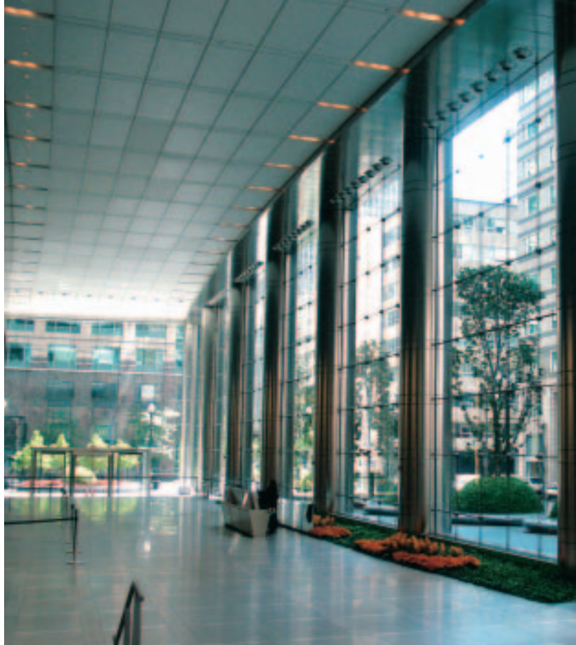
A wall of anti-reflective glass encloses the 13-meter-high lobby.

The main idea behind this design was to create the appearance of a uniform glass facade without the interference of supporting structures. It thus gives the impression of a transparent suspended glass curtain. Architect Steve Nilles compared this kind of construction to the principle of a tennis racket. When a tennis ball hits the racket, the tightly interlaced network of strings changes shape, but then immediately springs back to its original position as defined by the frame. The stress on the glass facade,