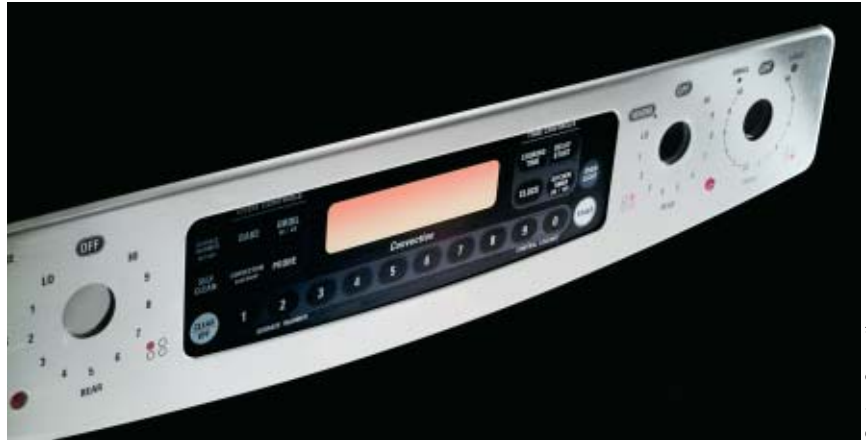
This control panel front combines decorated glass, field effect touch technology and stainless steel – and all from a single source.