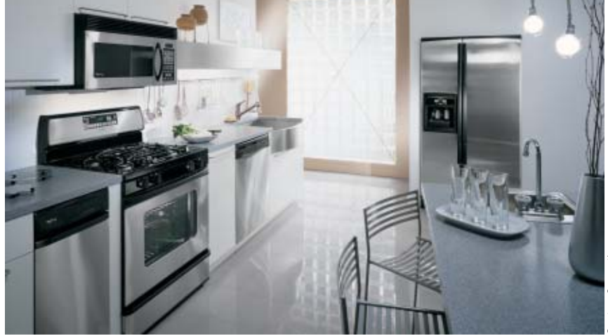
Stainless steel kitchens are in fashion and even gaining in popularity.