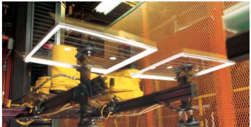
The fully automatic facility with stringent quality standards produces encapsulated shelves for refrigerators.