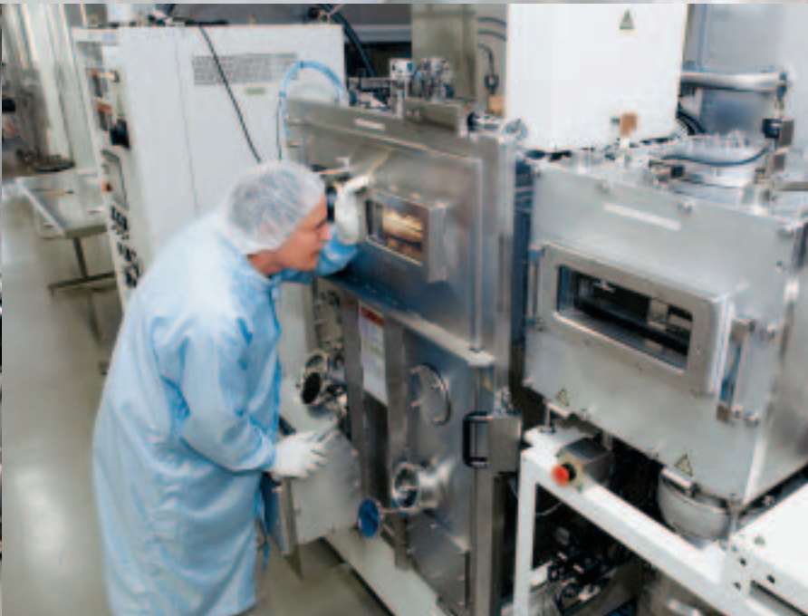
OLED components are processed in inert gas and vacuum conditions due to their sensitivity to oxygen and humidity.