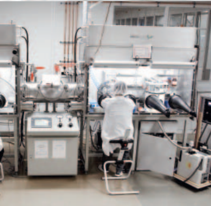
Coating processes are tested in a special "research tool."

Practical and aesthetic: OLED light sources are characterized by a wide angle of emission, color brilliance, high luminosity and high energy efficiency.