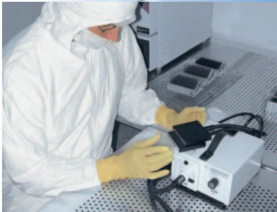
Schott "Slide A" glass substrates are subjected to a strict quality control in order to ensure reliability and top product quality. Above, the slides are undergoing a visual inspection.

People involved in pharmaceutical drug discovery research are looking to increase the reproducibility of the results from all the technologies used. The reliability of the initial data is of major economic importance for the pharmaceutical industry, in order to select those active ingredient candidates with the best prospects. The early sorting out of possible "flops" will lead to more efficient drug discovery research and ultimately to cost savings running into the millions.