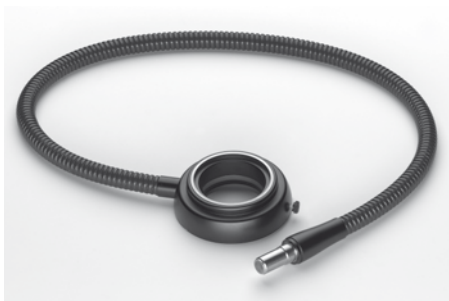
Annular ringlight Jumbo 66 mm