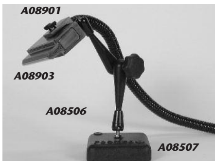
3" Lightline, A08903, with Holder, A08901, supported by an articulated arm, A08506, and base, A08507