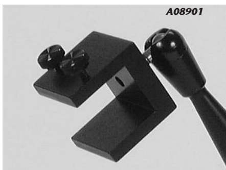
Lightline Holder, A08901