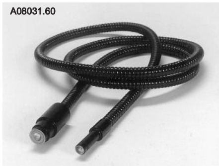
Single Bundle, A08031.60