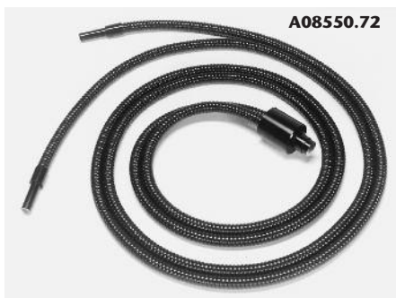
Dual Bundle, A08550.72