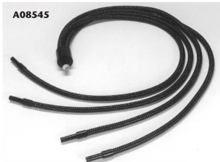
Quad Bundle, A08545