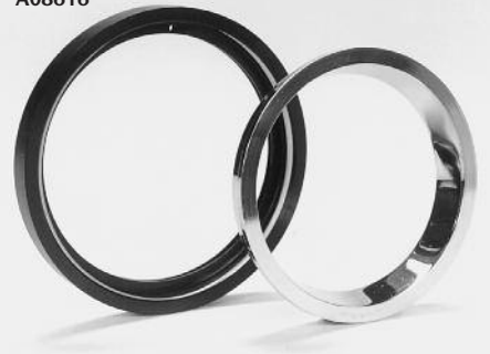
Reflector Ring, A08616