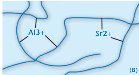
Organic acid – unlinked (A) and linked (B) (cured) by ions out of the glass