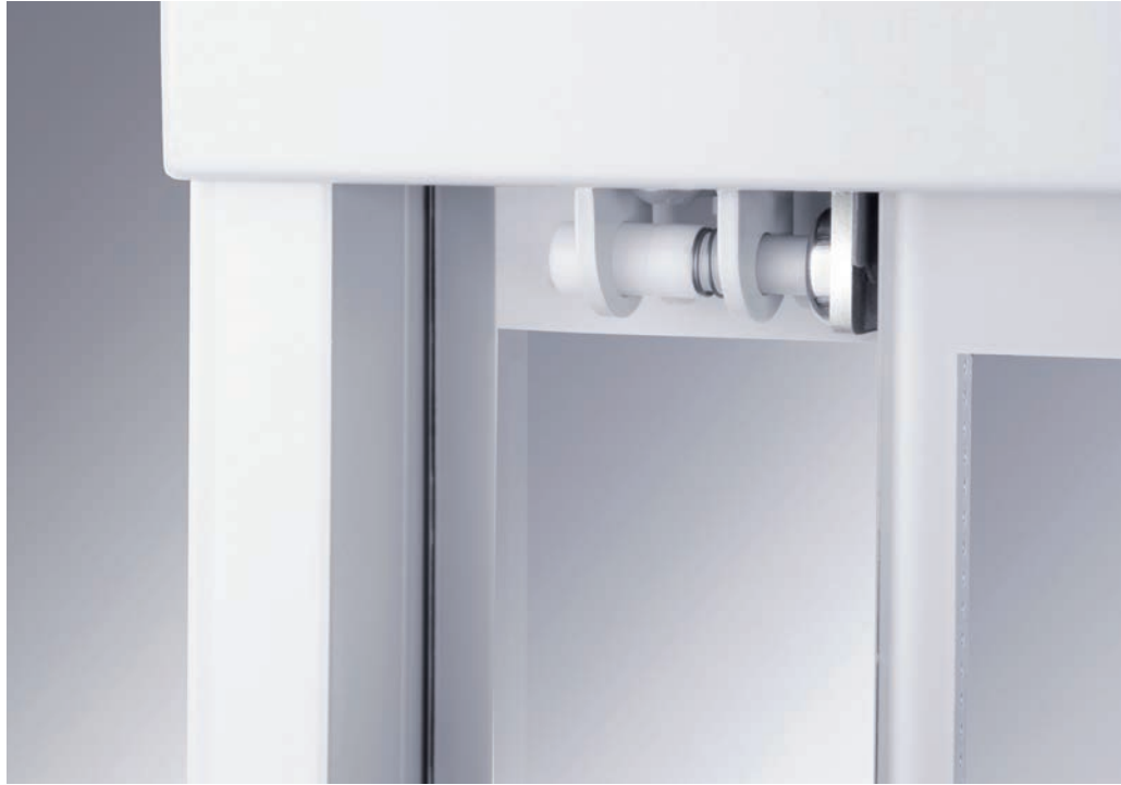
Hold open function for safe and easy usage.