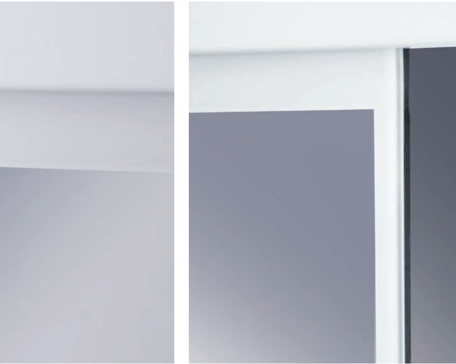
A damper hidden in the frame enables safe and smooth door closing.