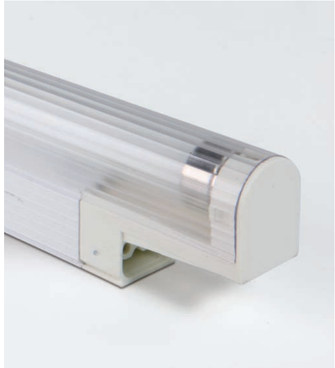
Fluorescent tube lighting.