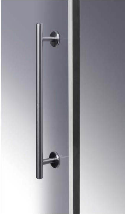
Stainless steel handle for comfortable opening.