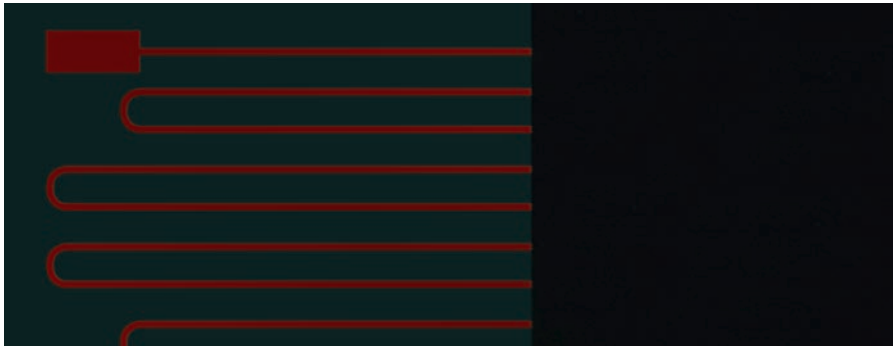
Left: visible printed heating circuit