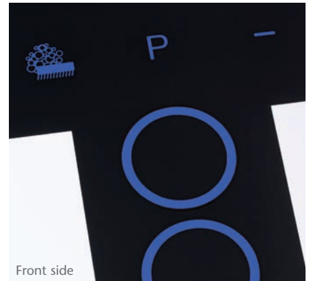
Control panel printed with circuits for the assembly of capacitive sensors